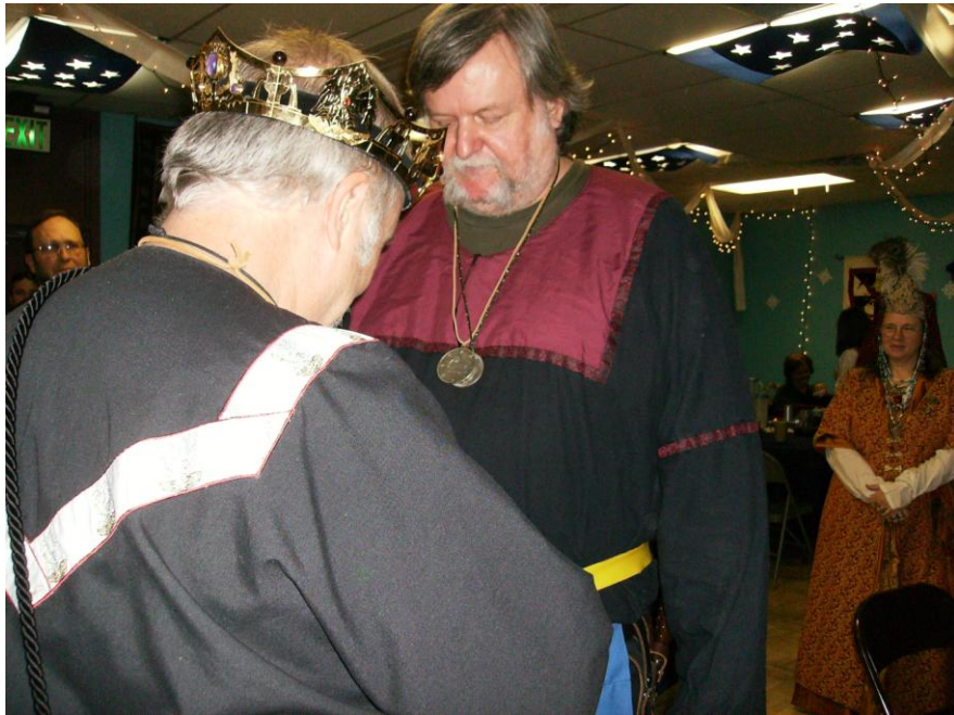
Lord Lingorm's Belting