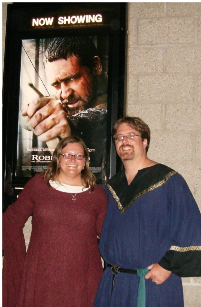
Their Excellencies and Robin Hood