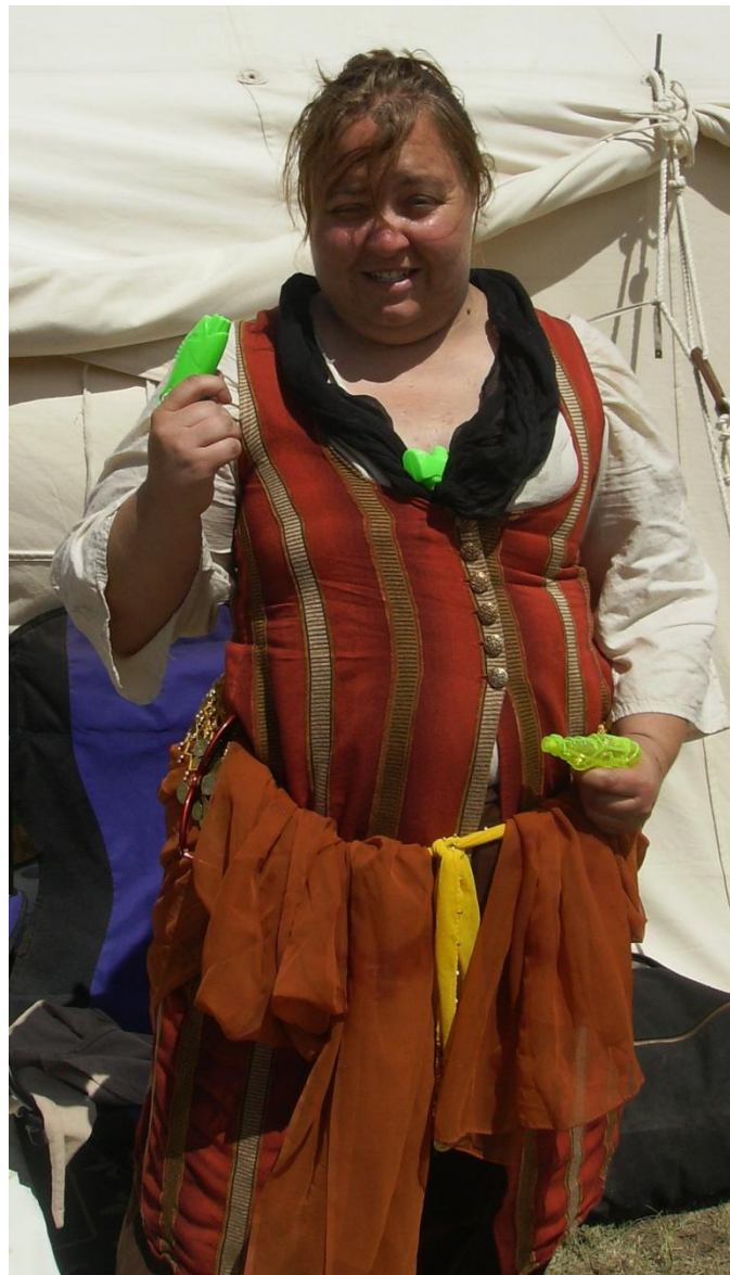
Lady Louie victorious in the water fight!