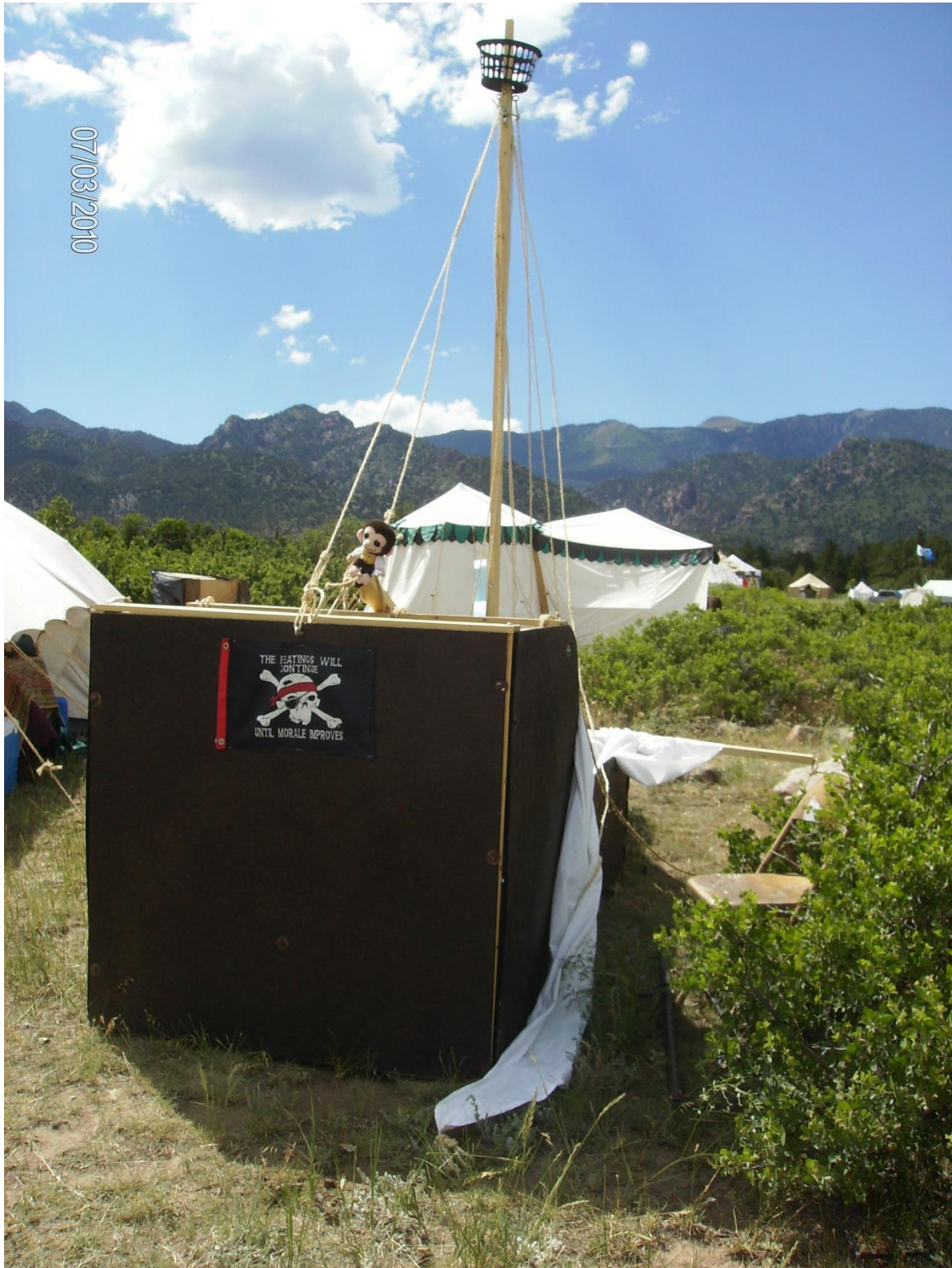
The F.A.E. MacRae (Fontaine Arrow Eater MacRae)