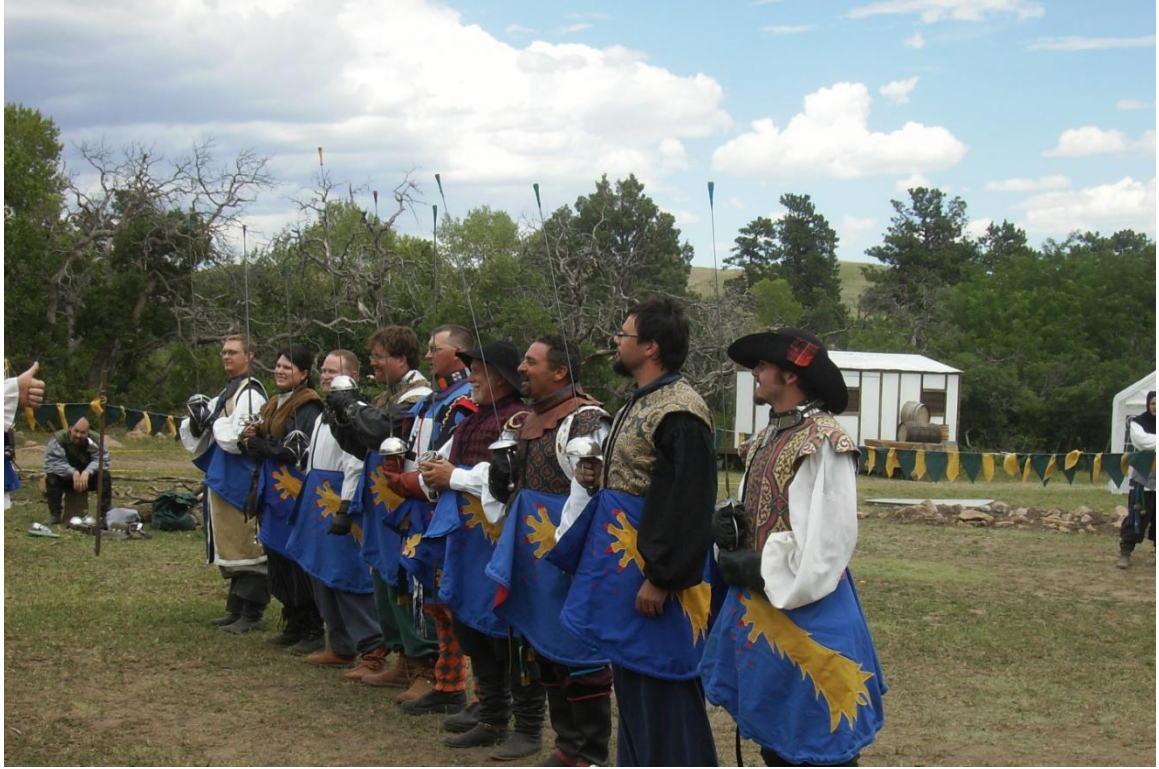
The Golden Paws received accolades for their Pageantry