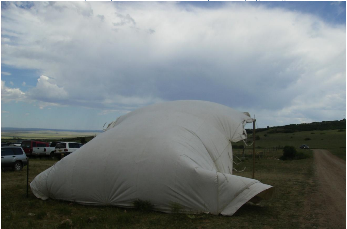
The winds tried to blow away many...