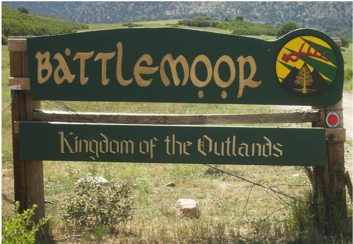
Entrance to Battlemoor

The Official Newsletter of the Barony of Fontaine dans Sable July 2010 ~ A.S. XLV