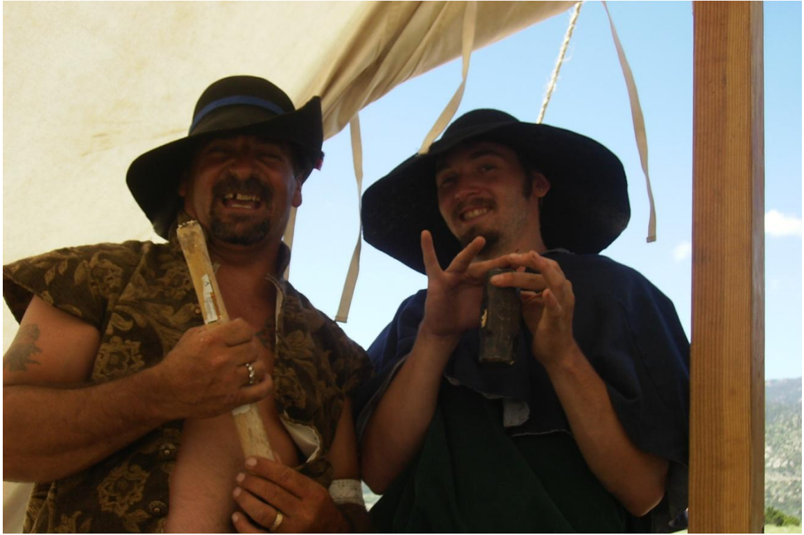
There was some wind damage..this hammer gave its life in service to the Barony