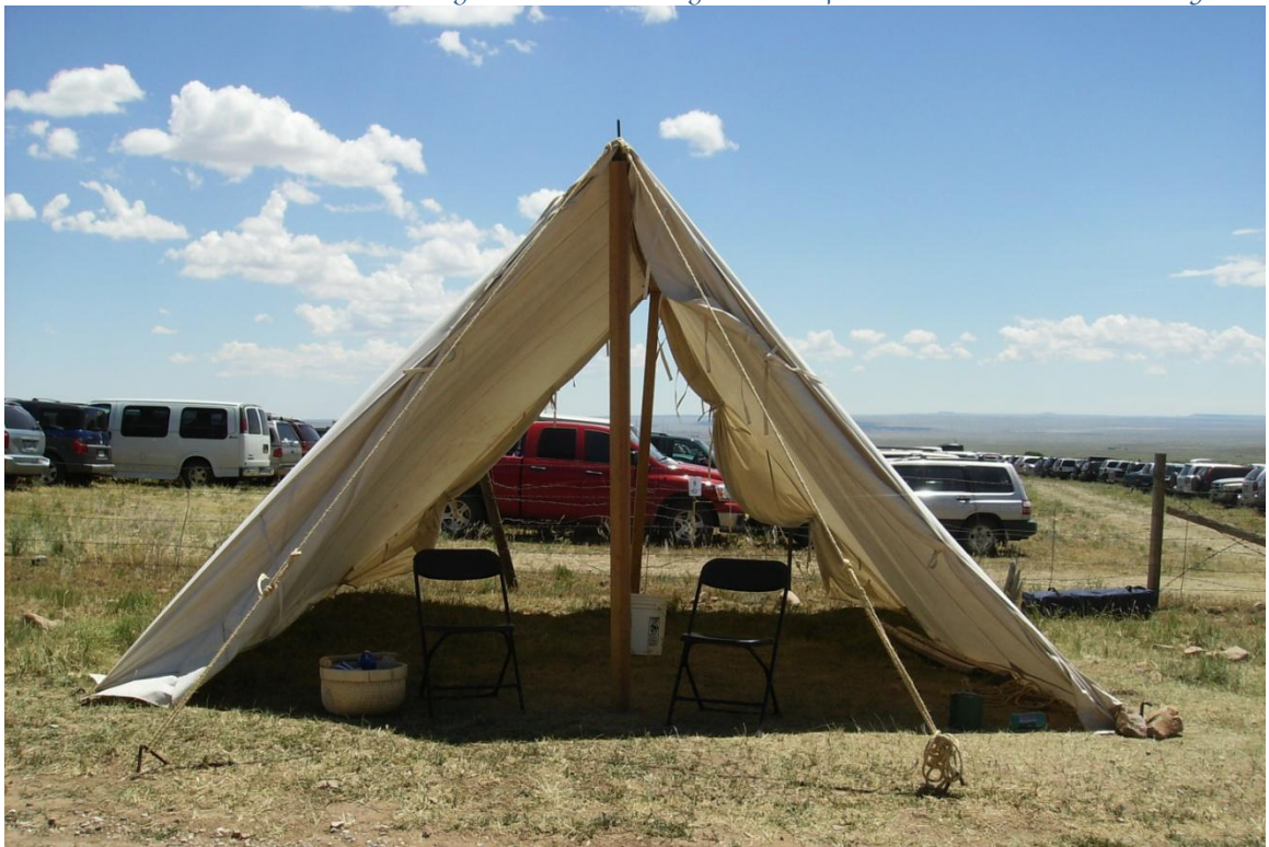
Through superior teamwork, the winds were vanquished! Thank you to all who helped keep tents and spirits up!