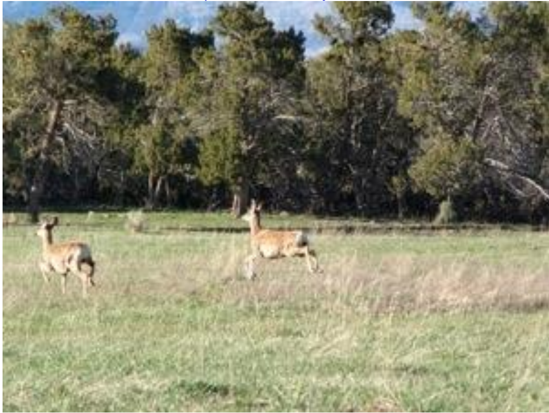
NEW WARDER SITE

For more information look to the Warders website: www.fontainasca.org/warders2010