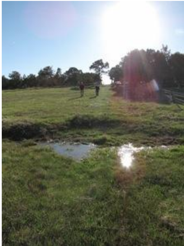
New Warders Site