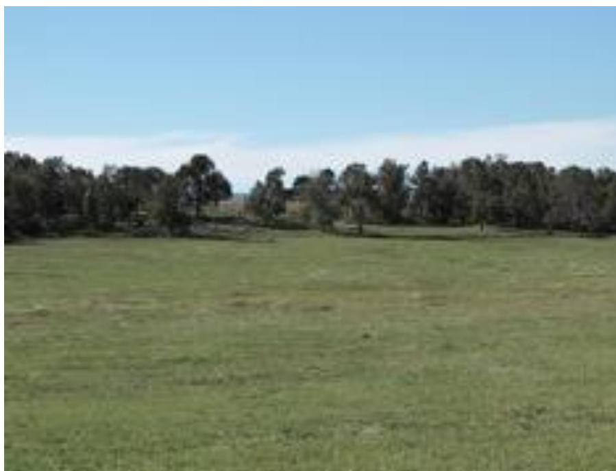
New Warders Site

The Official Newsletter of the Barony of Fontaine dans Sable September 2010 ~ A.S. XLV