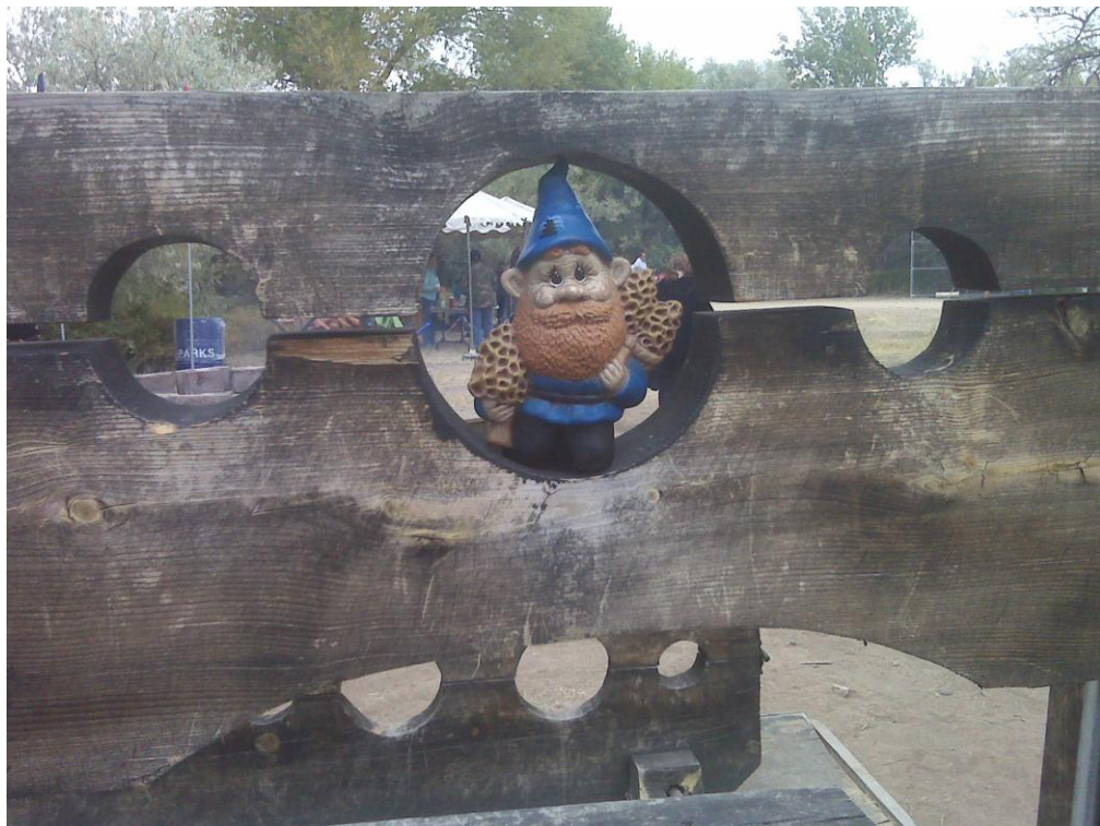
And threw Gnorman into the stocks!!!