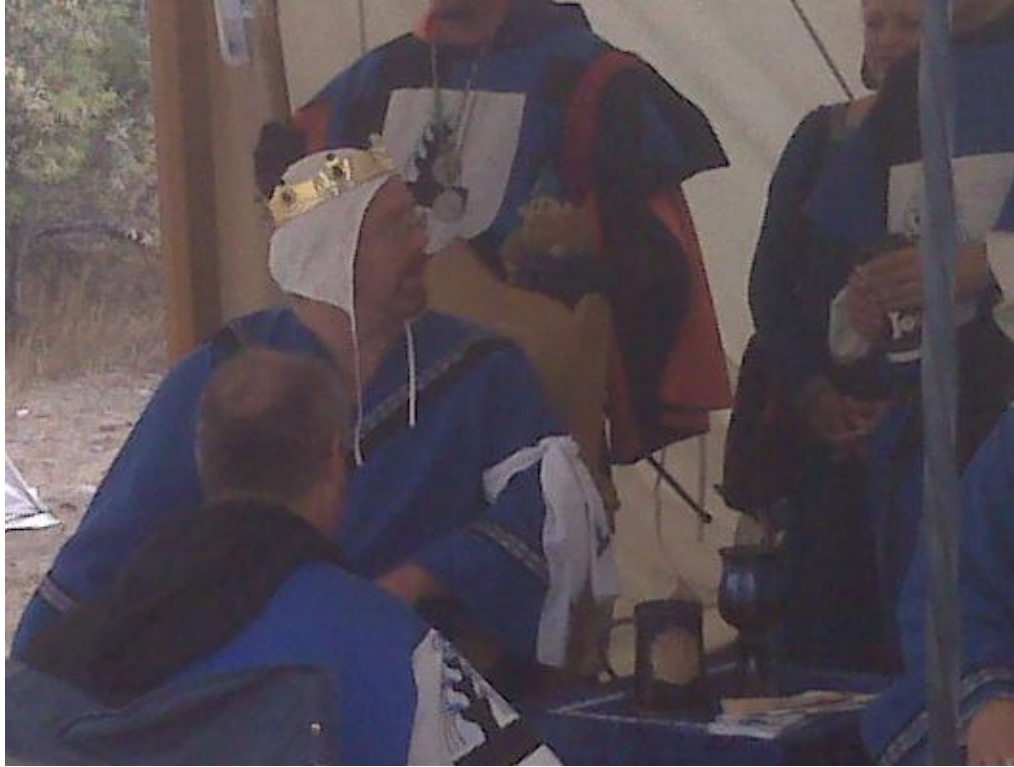
The Baron caught him...