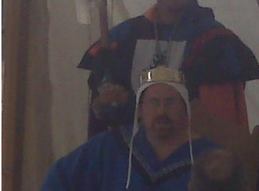
Gnorman was listening in on Baronial business!!!