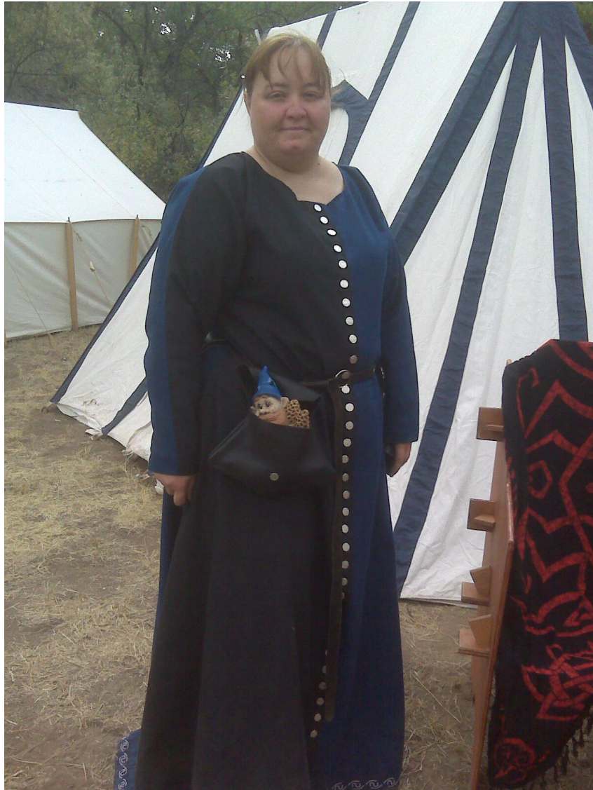
The Keeper of the Gnome

Gnorman came out to play at The Farmington Renaissance Faire!