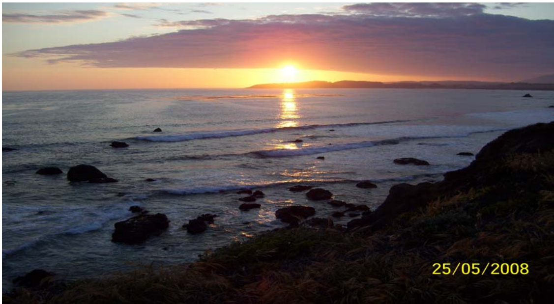
Sunset on Beach at Cambria, California.