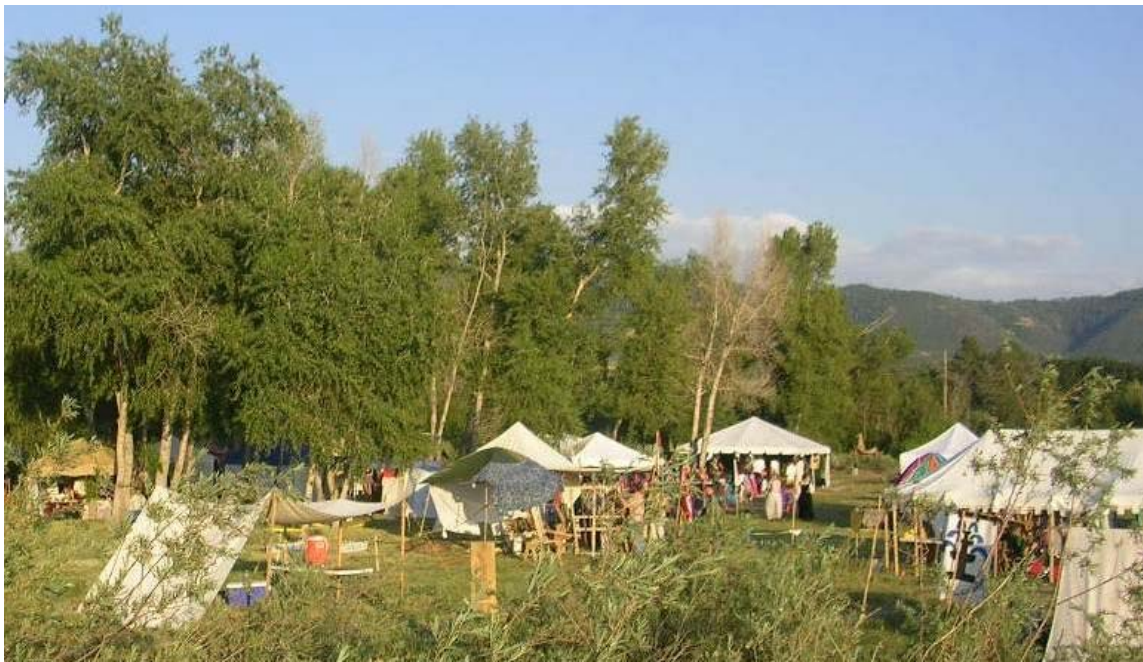
View of the SCA Village at the Mancos Renaissance Faire