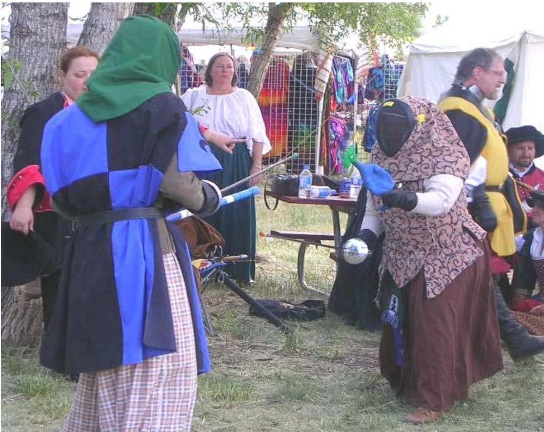
Mother and Son duke it out on the battlefield

Lady Lasairfhiona inghean an sheanchaidhe deputy rapier marshall