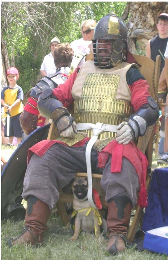
Sir Qara Gan and Otto attempt to chill out in the little bit of shade.