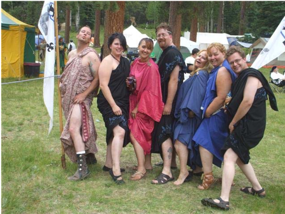
Me and my gang hanging out at the Roman Games

This last weekend was Baron's War and I finally got to relax. There were no challenges, or snatchings. The site trolls were again very generous and gave me a site token. I got to wander around and watch the night tournaments, and sample beer and tequila.