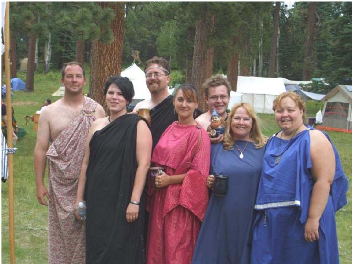
LORD DOGAN, Lady aili, thl angus, BARONESS CEARA, WILLIAM, GNORMAN, thl evain and Lady Louie dressed for the Roman games at Lonely mountain defender